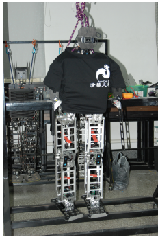
Fig. 1. THU-Strider robot

Tsinghua University, Beijing, China mgzhao@mail.tsinghua.edu.cn