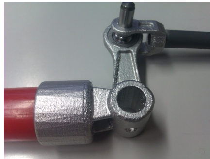
Fig. 3. knee joint

With this procedure complex items with cavities and heavily curved surfaces can be build. The design is not limited by constraints from conventional manufacturing. With this technology highly optimized structures can be manufactured [Ge1]. These are at least the joints (knee, elbow, hand) for the carbon tubes, also carrying the attachments for servos, cables and so on. As one can see in figure 3, the SLM process is ideal for producing elements like knee-joints.