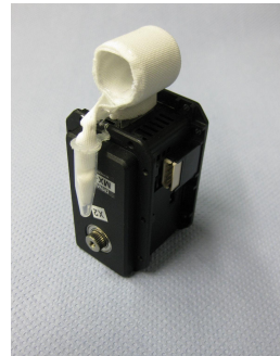
Fig. 2. Servo including wetted fleece for cooling