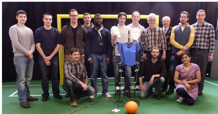
Fig. 5. Sweaty Team 2014.