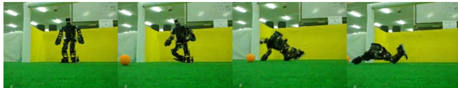
Fig.3 (b) Motion of Block a Ball