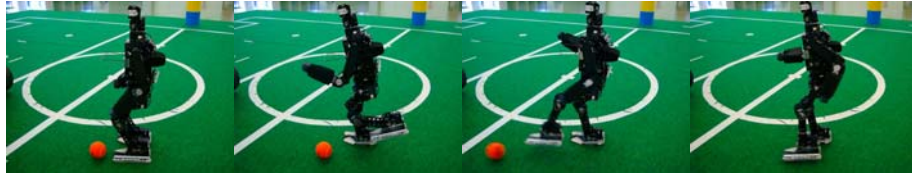
Fig.3 (a) Motion of Kick a Ball

sensors via A/D converter. According the data, the robot modifies the walking motion to prevent falls. The robot does not fall practically, however, in game it sometime fall by pushing other robot. When the robot stays such situation, it detects the fall and stand up smoothly.