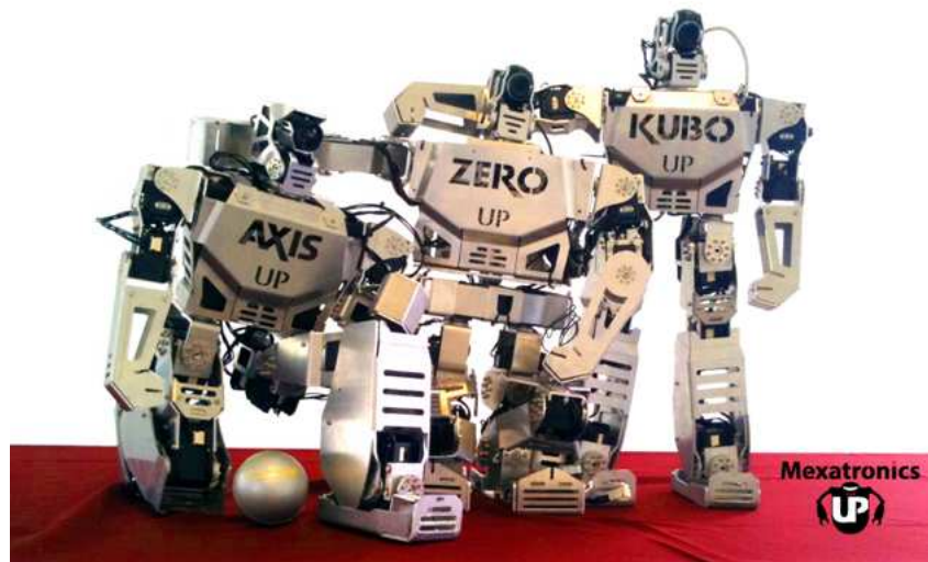
Fig. 1. Mexatronics Humanoid Robots Team

Notice of commitment: The team Mexatronics UP-CINVESTAV commits to participate in RoboCup Mexico 2012 and to provide a referee knowledgeable of the rules of the Humanoid League to serve during the competition.