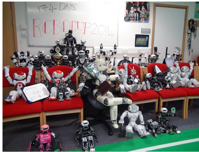
Fig. 1. The wide variety of humanoid robots used at Plymouth University, including all of the Drake bipedal robots.

Plymouth Humanoids has a large team of humanoid robots, with eleven for teaching, five for competition and one for outreach. All of the robots are built to the same RoboCup specification, making code production easily portable. The aim is that everyone interested in robot football has the opportunity to participate. Figure 1 has all the humanoid robots at Plymouth University.