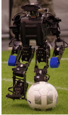
(a) robot kicking the ball