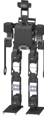
(b) mechanical sketch