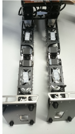
Fig. 3. Studs and Series Knee

year we revised the framework together. The main advantage of the now used framework is the modularity that enables code exchanges in an easier way among each other. Therefore, we (WF Wolves & Hamburg Bit-Bots) can develop software modules independently from each other but still share and compare them. Since ROS is being used more often in RoboCup, cooperation with other teams is also getting easier. Our code is open source and available online 4 .