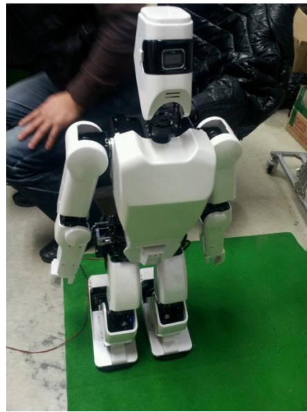
External Armor Attached