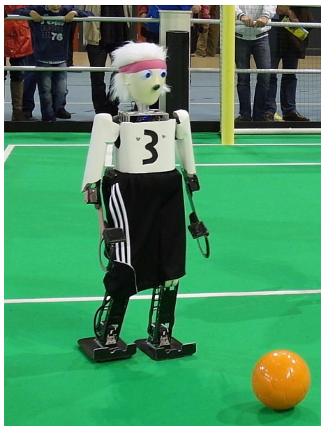
Fig. 3. The NimbRo robot Copedo