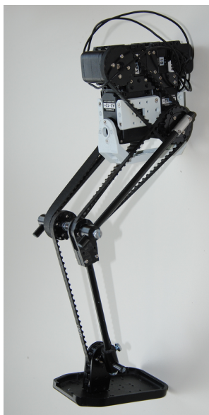
Fig. 2. Current model of the leg

can help in implementing running-like motions. Another innovation applied in the mechanical design of the robot is to shift the weight distribution of the leg actuators towards the hip to increase the response time of the legs. This is a key feature to stabilize the walking/running motion. Efforts have been made to hold the proportions as human-like as possible. Table 1 illustrates the physical measurements of the robot. To facilitate exchange of the players, all robots use mechanically the same structure.