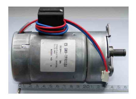
Fig. 7. Side view of motor