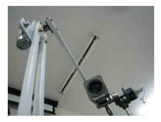
Fig. 7. 5DOF arm

A 5DOF arm is used for camera up and down motion capability and maintains more complete domination upon environment. It can set camera 90 centimeters higher than robot level. In addition a Hall Effect sensor is used for determining arms situation and better control of robot.