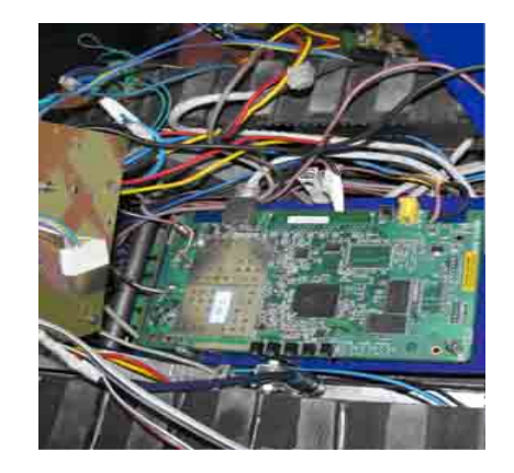
Fig. 3. Dlink Access Point Board