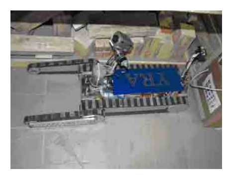
Fig. 1. YRA Manual Rescue Robot

Our robot is started by an operator, through a remote control device, and is ready to operate after passing 4 minutes (it is needed for AP to initiate a safe communication with computer). The weight of robot is relatively high (about 30 KG) therefore it is difficult to be repositioned by only a single operator. However, we hope, reducing the weight within the due time before starting-time of the competition, by applying some modification in such a manner it can be handled by an individual person. With respect to intermediatory circuits and other parts and instruments used in the device, it is less likely to face a difficulty or fault during the contests; however, in case of any problem there are ready- spare parts to be replaced quickly.