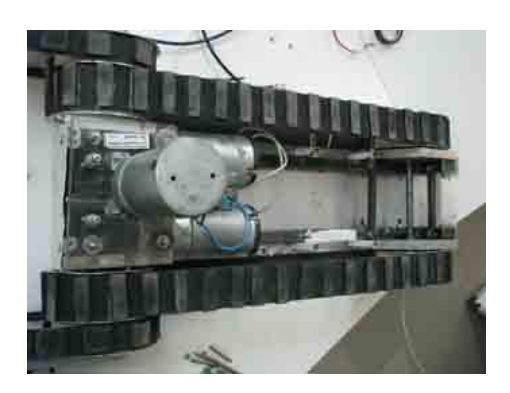
Fig. 6. Motors and straps

Robot propellant force is maintained by motors, that their power for reinforcement is given to the gearbox and gearwheels of robots, and that these gearwheels will move the straps and lead to the mobility of robot. Movement of robot's arms is empowered by separate motor and gearbox. Appendix B covers more complete information on the subject.