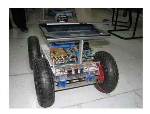
Fig. 2. YRA Autonomous Rescue Robot