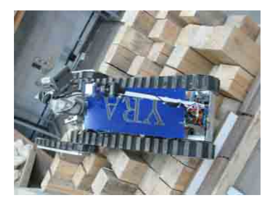
Fig. 8. YRA in practise field