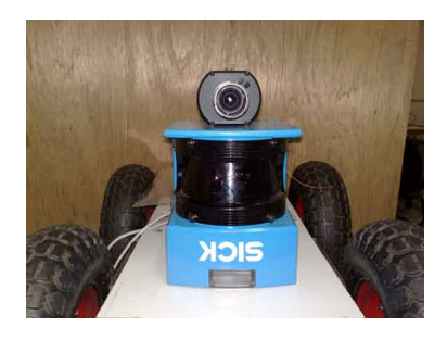
Fig. 5. Laser Scanner

A laser scanner is used for production of map, capable of determining walls and other materials on the ground and therefore is able to draw the way map correctly in such a manner that the place of injured persons would be defined by operator. Application of an accelerometer to assess amount of repositioning, and level difference in the environment would cause better and exact recognition of way-map and injured position. At the end of composition, all exploited signs of injured-persons and way-map would be printed.