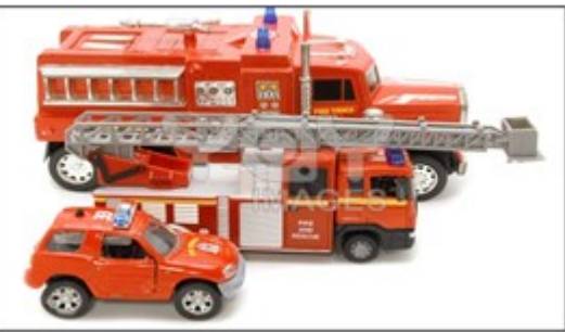
Figure 1 Fire brigades in real world

Associating different tasks to different agents is another feature that helps us move toward reality. As you know in real life we have different types of fire cars as in picture below.