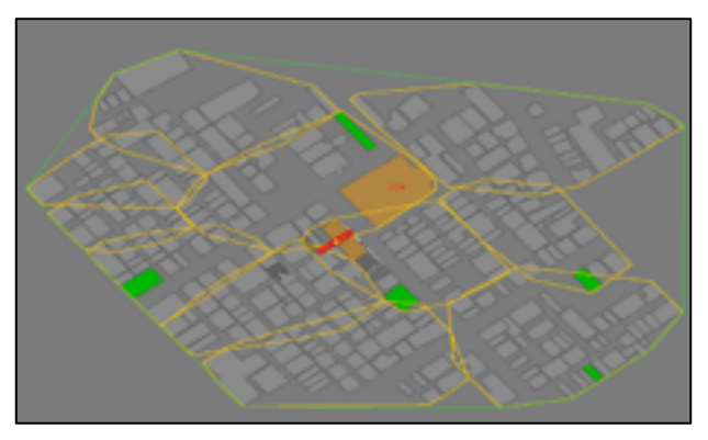
Fig. 1. Clustering a map using K-means algorithm

Clustering plays a sufficient role in how agents coordinate and do their tasks. The use of an efficient algorithm would enhance the performance generally. K-means algorithm was chosen for this purpose. [1, 2] This algorithm is used separately for each agent type, and therefore the number of clusters differs regarding the type of agents. The number of clusters for each type is equal to the number of agents, and is specified using the K-means algorithm. K-means clustering aims to partition observations into k clusters in which each observation belongs to the cluster with the nearest mean, serving as a prototype of the cluster. [1, 2]