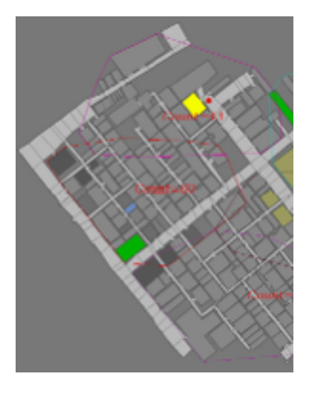
Fig. 5. The agent starts its search from the nearest house -which is shown with yellow color-in its own cluster , which is shown with pink color.