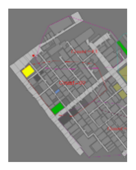
Fig. 6. After finish checking its own cluster, the agent searches the nearest building which is shown with yellow, in another cluster.In this example the other cluster is shown with red