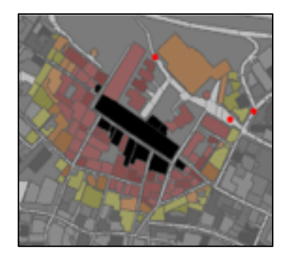
Fig. 3. Estimated Fire In That Fire Zone