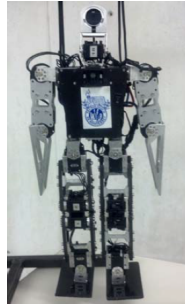
Fig. 1. Bogobot V2, developed by ITESM