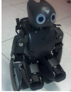
Fig. 4. DARwIn-OP, developed by ROBOTIS