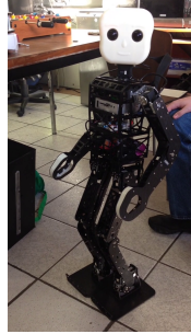
Fig. 5. NimbRo-OP, developed by Universität Bonn