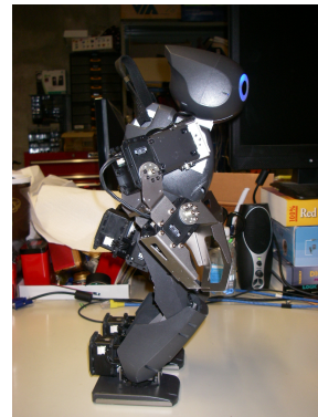
Figure 1: One of our DARwIn-OP robots from the front and side. This robot is equipped with single-DOF hands