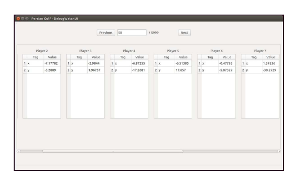
Fig. 5. A sample cup in Tournament Planning and Analyzing Software

Debugging an agent's code is not easy during an implementation of a highlevel algorithm. Most of the actions involve more than one cycle and need to be considered in a sequential timeline so that we find the time in which agent makes a wrong decision. Besides that, we need to check more than just one parameter and handling a lot pf parameters and checking them in a row for different cycles requires special effort that is not constantly feasible. To make debugging process easier, we have designed a new software that helps you debug your problems during the match. It can be cooperate with soccer logplayer so as to synchronize the debugging process in both graphical and textual aspects. Figure 5 represents DebugWatch window. In this example, we have printed the x and y coordinates of each player. In traditional methods, we had to check each agents outputs separately in different files and it was a very time consuming task. By utilizing Debug Watch we are able to see all agents outputs in each cycle just in a moment.