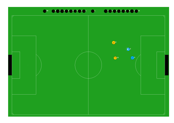
Fig. 4. A sample cup in Tournament Planning and Analyzing Software