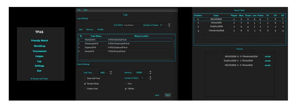
Fig. 3. A sample cup in Tournament Planning and Analyzing Software

Tournament Planning and Analyzing Software (TPAS) is a powerful tool written by Java language and is able to hold diverse types tournaments such as cup, league, world cup, a simple friendly match or even create arbitrary tournaments with arbitrary rules. Each tournament type has its own order of playing matches and corresponds to different real tournaments. For instance, in the cup mode, each team will quit the competitions if it looses against its rival; winning a match leads a team to the next round and it can be continued until the final match that a victory there makes the team the champion of the tournament. Figure 3 shows an overview of the software graphical interface and a sample cup with three teams and the table and result of the competition. Because soccer 2D simulation league in WorldCup competitions uses an specific method for holding matches in its different rounds in the recent years, we have put a world cup mode in our software to handle its tournament matches easily.