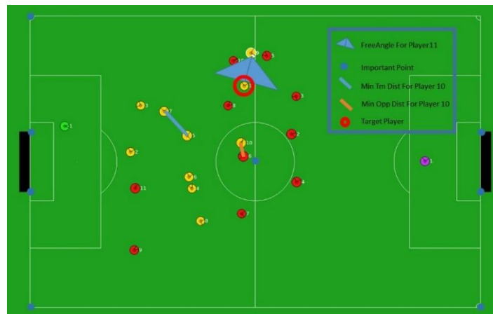
Fig. 1. Overview of the training data features (input part).