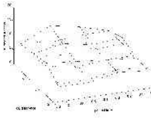
Fig. 2. Comparison of emotional agent with unemotional agent in simulation