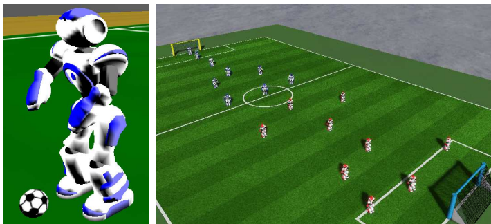
Figure 1. On the left is a screenshot of the Nao agent, and on the right a view of the soccer field during a 9 versus 9 game.