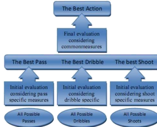
Fig. 3. Two phase decision making mechanism