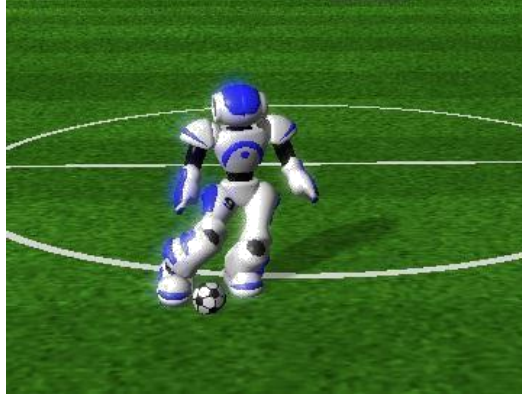
Fig. 2. Kicking to a position