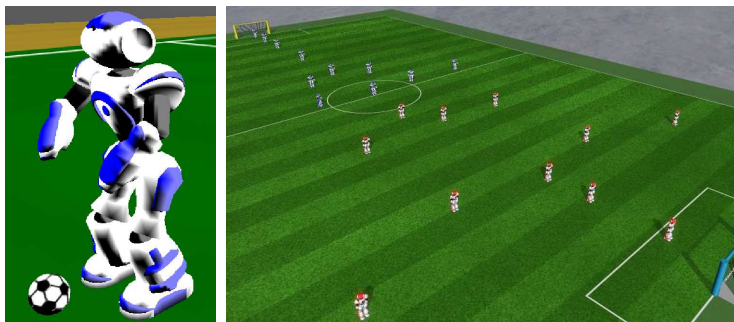
Figure 1. On the left is a screenshot of the Nao agent, and on the right a view of the soccer field during a 11 versus 11 game.