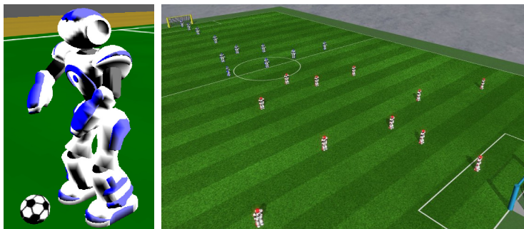
Figure 1. On the left is a screenshot of the Nao agent, and on the right a view of the soccer field during a 11 versus 11 game.