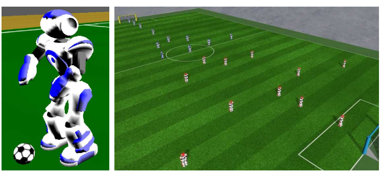
Figure 1. On the left is a screenshot of the Nao agent, and on the right a view of the soccer field during a 11 versus 11 game.