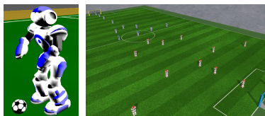
Fig. 1. On the left is a screenshot of the Nao agent, and on the right a view of the soccer field during a 11 versus 11 game.